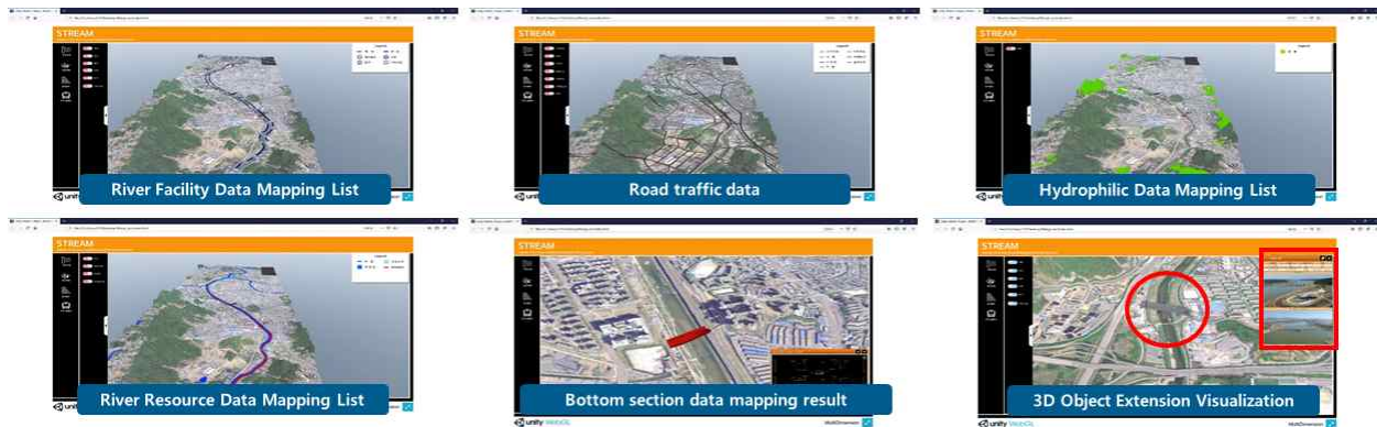
Figure 3. Functions of the STREAM Service

so that non-experts can easily acquire river information. However, only four of the six phases of system development have been completed, highlighting the necessity for continuous development and supplementation. In the future, we will apply the river facility evaluation technique considering river life cycle, river management business support, and response technology for prompt decision support. Based on this, it would be possible to construct a preventive river management system that overcomes the limitation that existing river information system can list or simply provide and process river management business support and decision support information. It would be also possible to develop an intelligent system that can support life cycle and provide basic information on river facilities and spatial information as well as current status and statistical data. In addition, it is expected to maximize the efficiency of work related to local rivers and the foundation for preparing national river comprehensive measures by efficiently managing national river-related data.